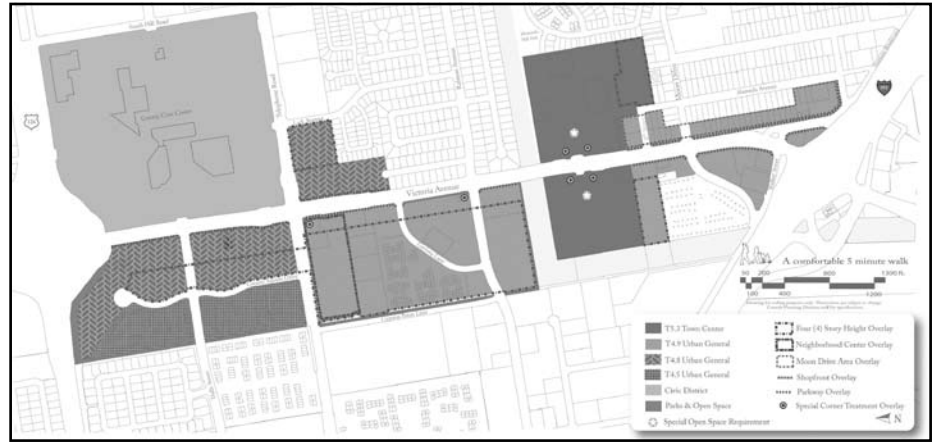
An infill area in Ventura where form-based coding has been applied